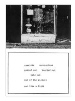
Fig. 10 Martha Rosler, The Bowery in Two Inadequate Descriptive Systems (detail), 1974–75, courtesy the artist