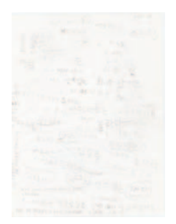
Fig. 14 Basic Korean (Study Sheet), 8/7/1997, pencil on paper, 9 3/4 x 7 in. (see also p. 77)